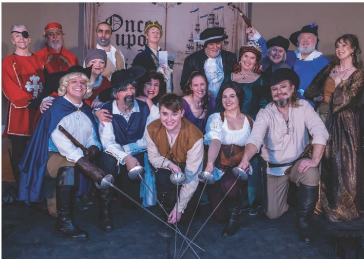
Cast of Ken Ludwig's The Three Musketeers

As a 501(c) 3 non-profit organization, our continued success depends on our audiences, our many volunteers, and our generous benefactors.