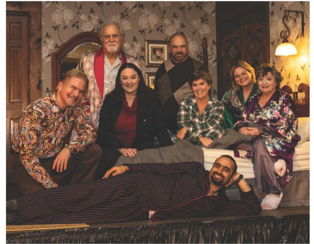
Cast of Bedroom Farce